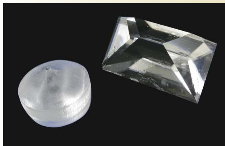
● High-quality single crystals