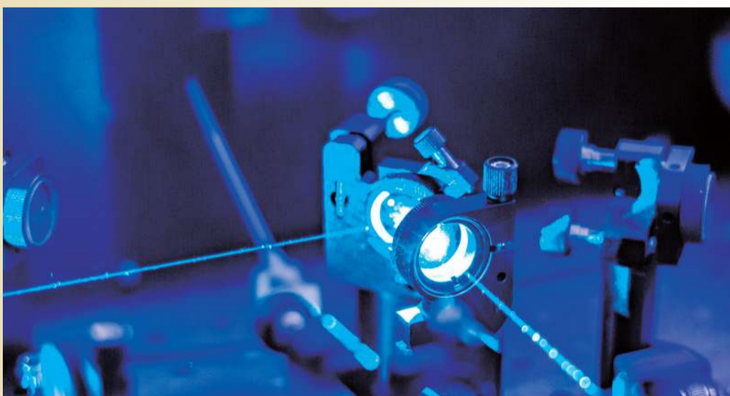
● Deep UV lasers for semiconductor inspection

Since our foundation in 2000, with the aim of being a global niche company of single crystals and lasers, we have been accumulating cutting-edge technologies and establishing originality and competitive advantage in the field of optics. The 21st century is said to be the age of light. With the mission of " Realizing prosperity with optical technology ", we shall continue to contribute to society with crystals and optics.